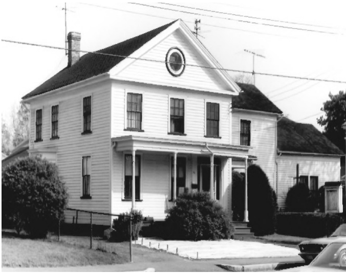
Edward Bellamy House

The City has a municipal Historical Commission who oversee preservation, protection, and development of the historical and archeological assets of the City. The Commission makes recommendations to the City Council (which then makes recommendations to the Massachusetts Historical Commission) about certifying historical and archeological landmarks.